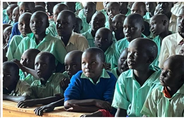
Kamketo Comprehensive School

We were able to visit quite a number of the primary schools – at Kamketo, Kasei, Nakoretee, Chepkinagh, Apur, and Wasat, as well as the secondary schools at Kamketo (girls) and Kasei (boys). We sought to meet with the head teachers and staff to find out how the school is progressing. Two of the primary schools were very encouraging with well organized leaders and a very supportive staff. We wish that could be said of every school! This area of West Pokot is remote and many teachers not from the area who are posted here would regard it as a punishment. There is a lot of absenteeism among teachers, one of the excuses being that education offices, banks and shopping are a day's journey away in Kapenguria. As serious was the low enrolment in the schools. Covid restrictions took many children out of the educational system for good. January is the beginning of the school year and many children were still seeking fees and others were still with parents in Uganda where they had gone for grazing their animals. Education is still not seen as vitally important by many. Much patience is needed with this community as they come out of a cattle-raiding culture into the modern era. But without the provision of education from where can we expect future church leaders to come?