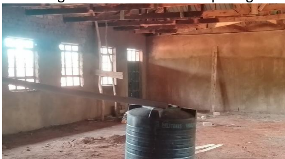
Plastering of the newly constructed Chepkinagh church building