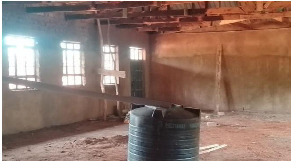
Plastering of the newly constructed Chepkinagh church building