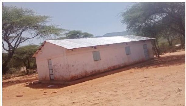
[Kamketo school dormitory before and after]