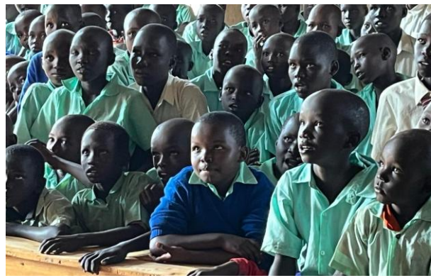
Kamketo Comprehensive School

We were able to visit quite a number of the primary schools – at Kamketo, Kasei, Nakorettee, Chepkinagh, Apur, and Wasat, as well as the secondary schools at Kamketo (girls) and Kasei (boys). We sought to meet with the head teachers and staff to find out how the school is progressing. Two of the primary schools were very encouraging with well organized leaders and a very supportive staff. We wish that could be said of every school! This area of West Pokot is remote and many teachers not from the area who are posted here would regard it as a punishment. There is a lot of absenteeism among teachers, one of the excuses being that education offices, banks and shopping are a day's journey away in Kapenguria. As serious was the low enrolment in the schools. Covid restrictions took many children out of the educational system for good. January is the beginning of the school year and many children were still seeking fees and others were still with parents in Uganda where they had gone for grazing their animals. Education is still not seen as vitally important by many. Much patience is needed with this community as they come out of a cattle-raiding culture into the modern era. But without the provision of education from where can we expect future church leaders to come?